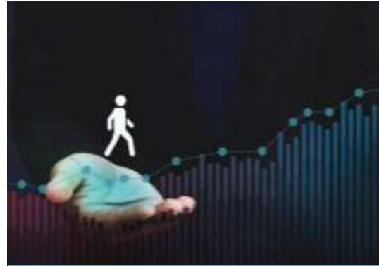
Dedicated Key Account Manager