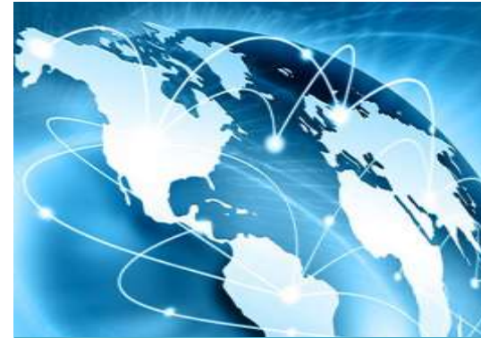
Mutual Recognition Agreement